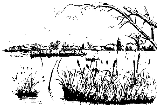
Golden Brook Storage Lagoon

Owned by Erewash Borough Council and managed by Derbyshire Wildlife Trust, this area of unimproved grassland, reed bed and willow woodland acts as a flood protection area for the Golden Brook. The site is listed in the Derbyshire Wildlife Sites Register as being rich in species, and is particularly important for wetland birds. Due to its sensitivity as a wildlife area and working flood defence lagoon, access is by permit only. Contact DWT on Derby 756610 for details.