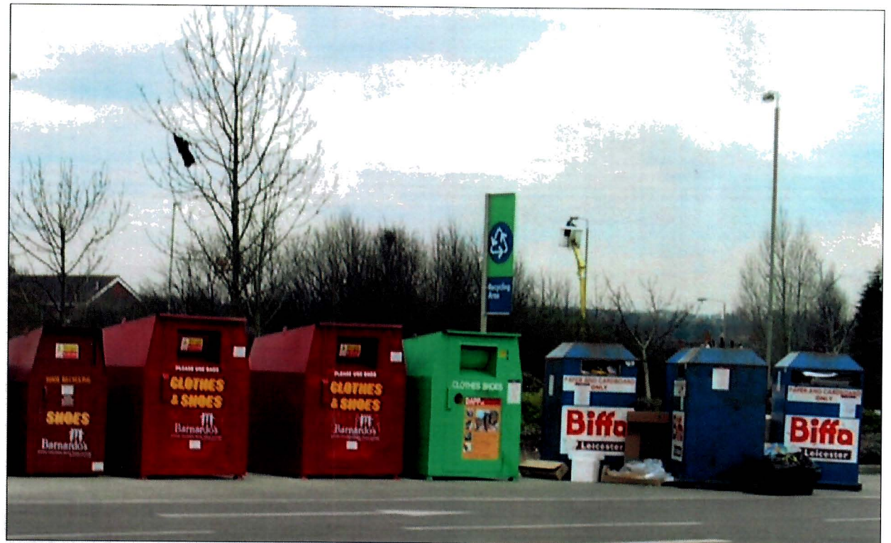
TYPICAL RECYCLING CENTRE (N.T.S)